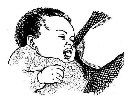
Infant ready to attach. Nose is opposite nipple, mouth is open wide.

If she agrees, you can start to help her.