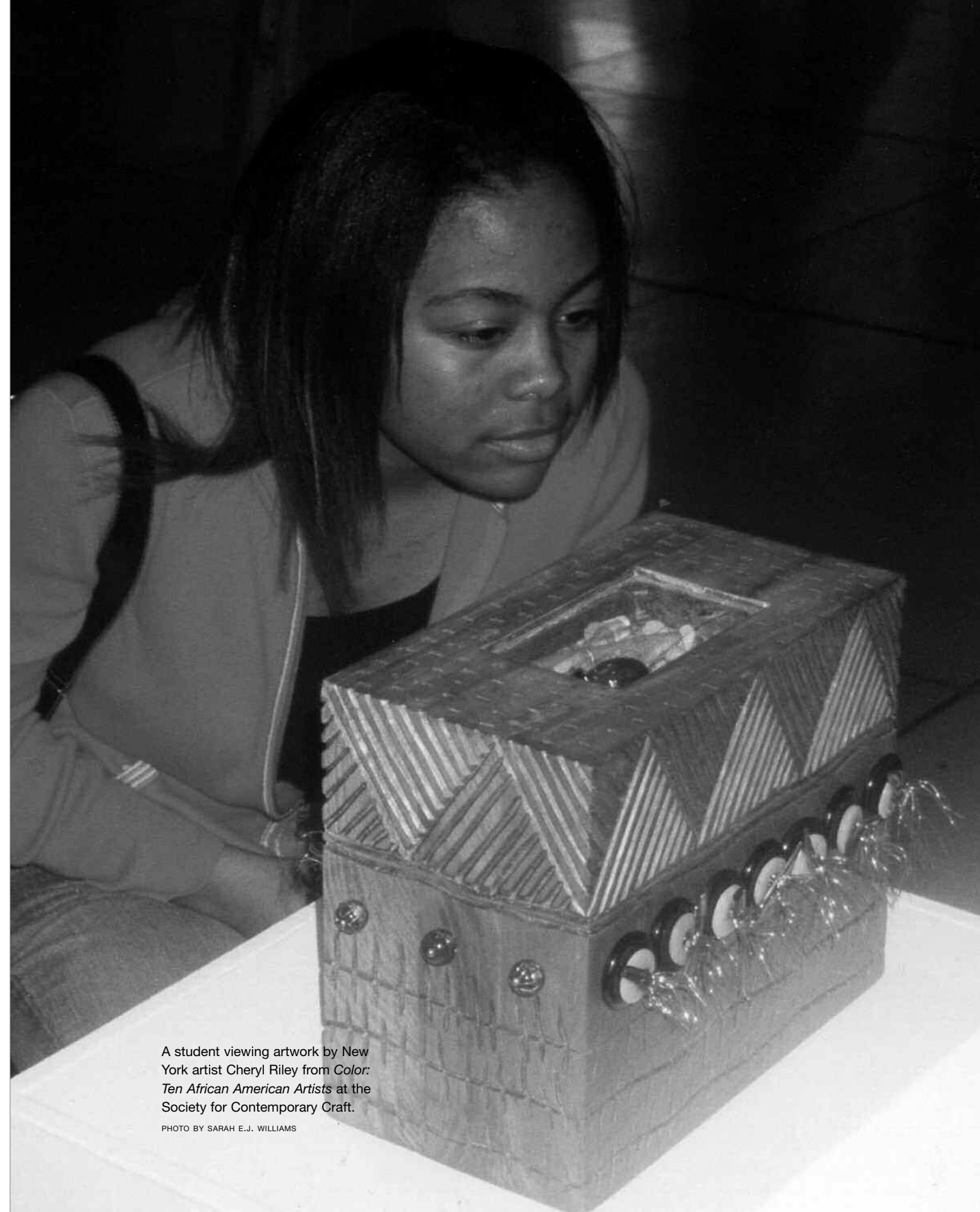
A student viewing artwork by New York artist Cheryl Riley from Color: Ten African American Artists at the Society for Contemporary Craft.

The key to African American students’ art participation is to create opportunities for them to encounter the arts specific to their experience, in a welcoming environment that fully acknowledges and celebrates the depth of the African American experience. African American young adults want to experience art that is a reflection of themselves as African Americans, art that either reveals something new and interesting about the Black experience or reaffirms for these students what it means to be an African American. The beauty, suffering, intelligence, humor, struggle, and achievements—all of it is important to these students. As one African American student explained, art is an avenue for African Americans to become connected