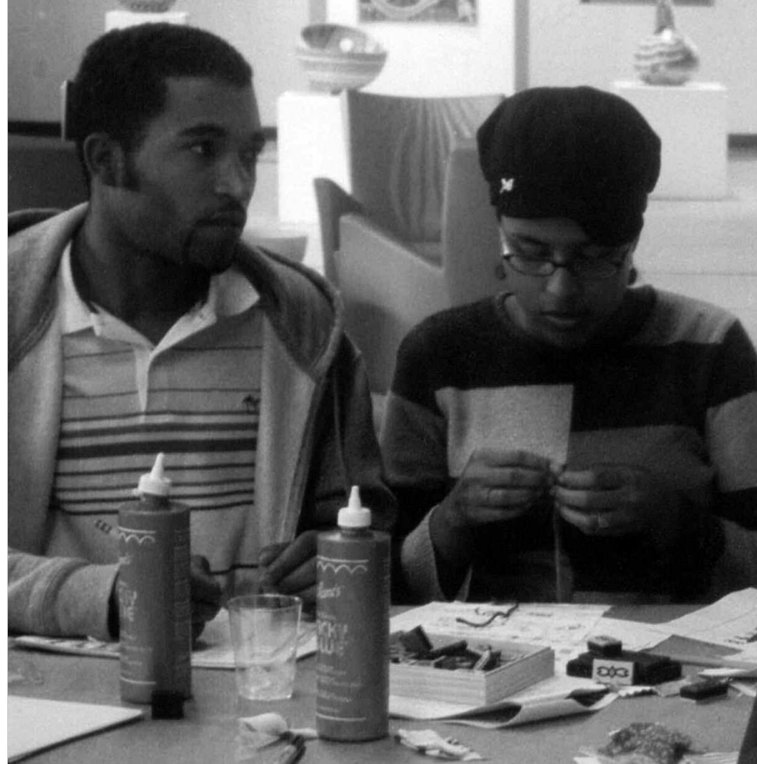
Two students making art at the Society for Contemporary Craft.

Interestingly, when asked how they prefer to spend their leisure time, African American students ranked attending an art event as their third choice; watching TV and renting movies taking the top two spots. Compared with the number-one ranking of cultural events among non-Black students, a clear difference appears between the interests in arts events between Black and non-Black students. PITT ARTS asked African American students why TV/movies ranked above arts, and they replied that time and ease of access were the critical reasons: they were easier to access, did not usually require pre-planning (such as buying tickets, gathering friends, or planning outfits), could be experienced indoors regardless of weather, and were considered cheaper than attending arts events. One student mentioned that if she could experience arts through