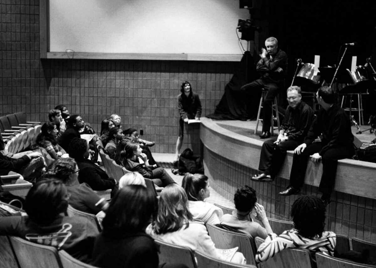
A talk-back session with Paquito D’Rivera and members of his band at Manchester Craftsmen’s Guild’s Music Hall.