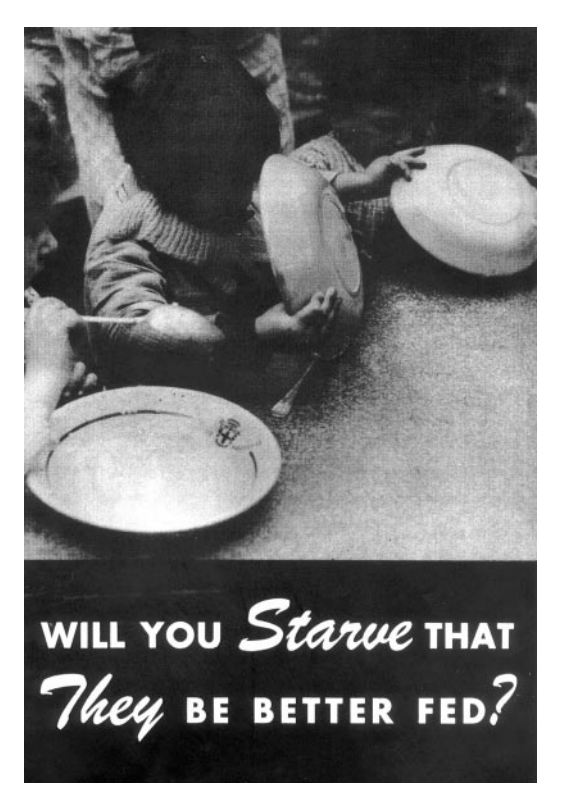
FIGURE 1 Recruitment brochure cover for the Minnesota Experiment. May 27, 1944.

draft boards. Conscientious objectors were assigned to the Civilian Public Service (CPS), where they participated in activities such as soil conservation, forest maintenance, and firefighting in work camps operated by the Historic Peace Churches (Mennonites, Quakers, and Brethren) (13). As the war progressed, conscientious objectors were also given the opportunity to volunteer for alternative service projects, including various medical experiments in which they served as human "guinea pigs." Keys obtained approval from the War Department to find suitable healthy men among the 12,000 conscientious objectors across the country. Brochures asking for volunteers were printed and disseminated among the work camps and sites of the CPS, and within a few months, Keys received >400 positive responses. Of these, 100 were interviewed and examined before 36 subjects were finally selected. The experiment was funded by the Office of the Surgeon General, organizations related to the Mennonites, Brethren, Quakers, and Unitarians, and some private industry groups.