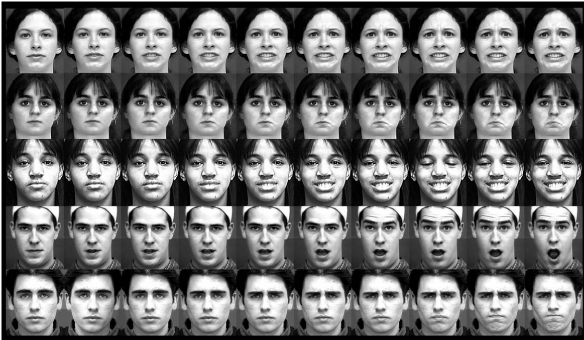
Fig. 1. Examples from the stimulus array for (top to bottom) models creating scared, sad, happy, surprised, and angry facial expressions.

harsh physical discipline, choking, scolding, and realistic threats to injure or abandon the child. Groups differed (control M = 2.5 , SD = 2.7 ; abused M = 40.0 , SD = 16.6 ) in this regard, F(1,94) = 229.1 , p < 0.001 . While parents are likely to under-report abusive behavior on these measures, it is unlikely that parents would systematically over-report these kinds of behaviors. Finally, because our hypotheses involved children's experience perceiving anger, we asked parents to complete the State-Trait Anger Expression Inventory. Parents did not differ in their reports of state anger—that is, a measure of how they were feeling at the moment (control M = 45.4 , SD = 3.5 ; abused M = 46.3 , SD = 5.2 ). However, abusive parents reported more trait anger—that is, how generally they feel and overtly express anger (control M = 43.9 , SD = 4.8 ; abused M = 55.1 , SD = 13.5 ), F(1,92) = 28.01 , p < 0.001 . Parent trait anger was associated with more abusive acts towards children, r = 0.35 , p = 0.001 , d = 0.71 , and children whose parents reported more abusive behaviors demonstrated more perceptual sensitivity to angry faces, r = 0.23 , p = 0.03 , d = 0.48 .