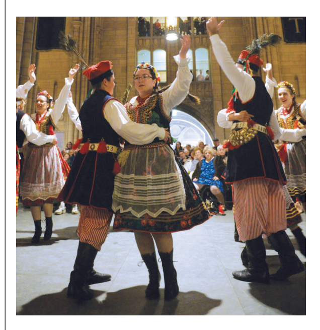
Lajkoniki dancers from Holy Family Catholic Church perform traditional Polish dances during Polishfest in the Cathedral of Learning Commons Room.

For more than 80 years, the Polish Nationality Room and its committee members have proudly celebrated the culture of the Poles who settled in Western Pennsylvania. ■