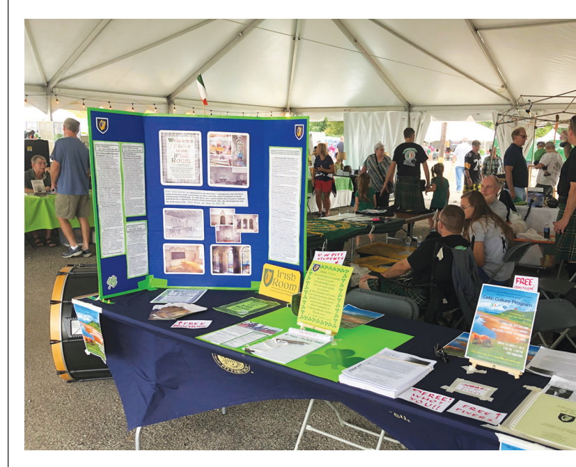
Irish Festival at the Waterfront, Homestead, Pa.

For the Nationality Rooms Holiday Open House, our committee members are gearing up to decorate the Irish Room with holly and welcome friends old and new. ■