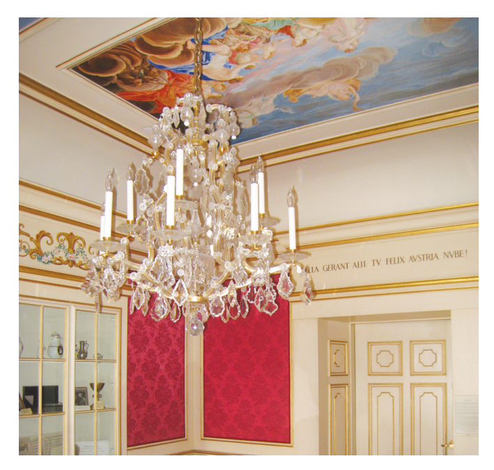
Austrian Nationality Room with murals by Celeste Parendo