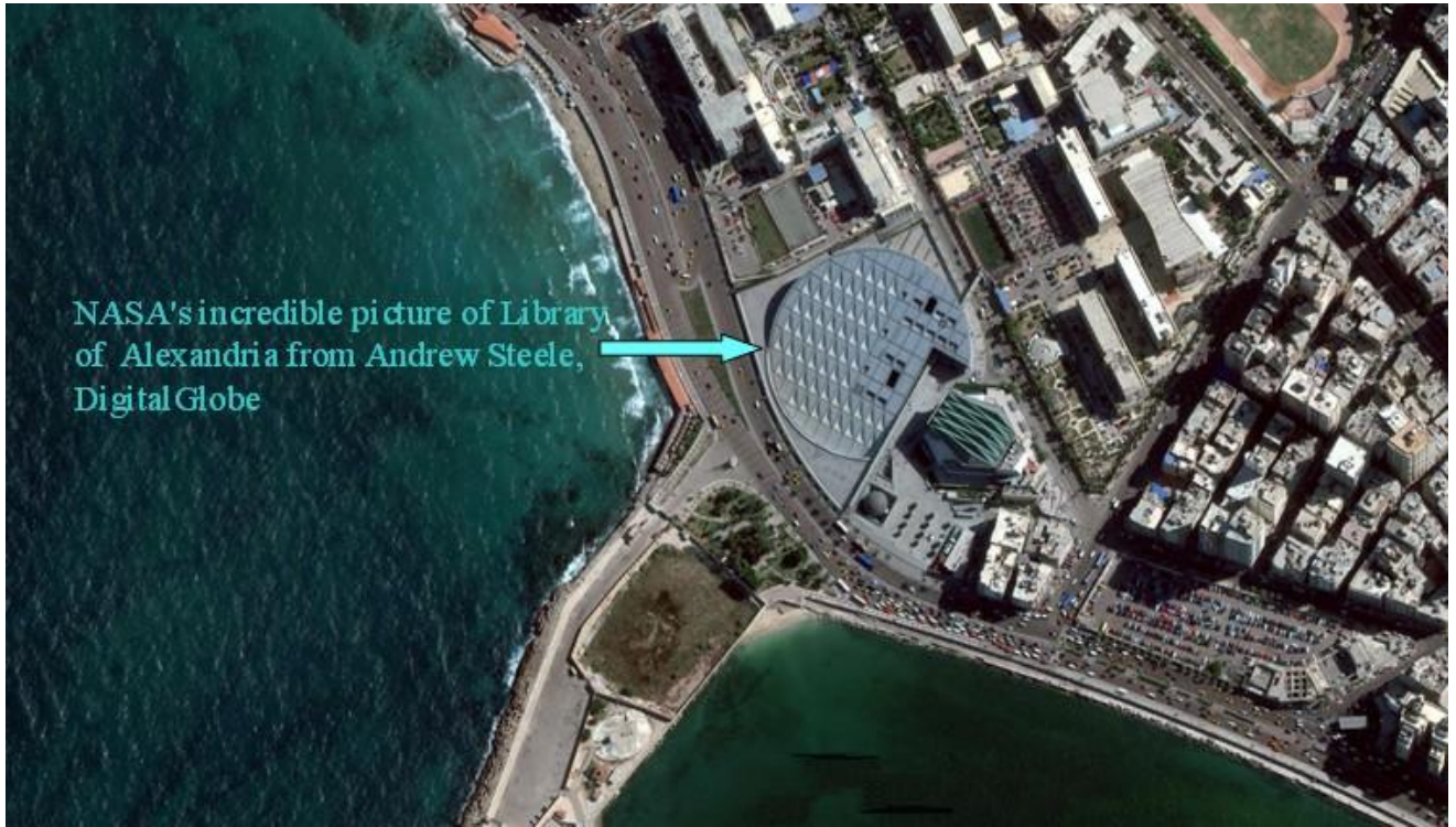
NASA's incredible picture of Library of Alexandria

http://www.pitt.edu/~super1/ResearchMethods/iSerageldinEuclidLibrary.htm Looking down from space, we can see 3000 years of history. Looking up we see the stars and the future