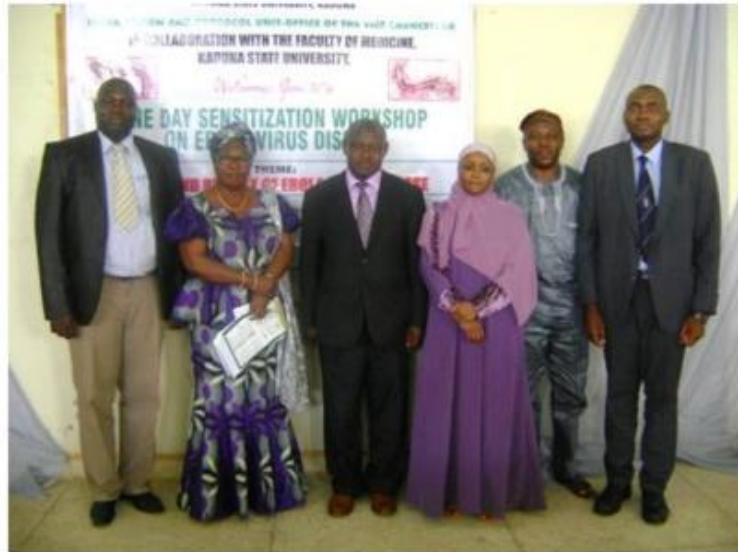
Authors of the lecture on Myths and Realities of EVD

http://www.pitt.edu/~super1/lecture/lec52511/002.htm