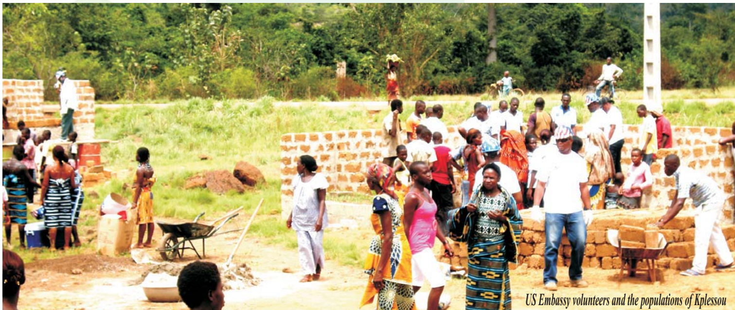
US Embassy volunteers and the populations of Kplessou