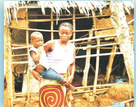
Living conditions in rural area

E stablished in 1999, Habitat for Humanity Côte d'Ivoire seeks to break the cycle of poverty by working with homeowners to provide safe, dry and secure homes, with decent sanitation.