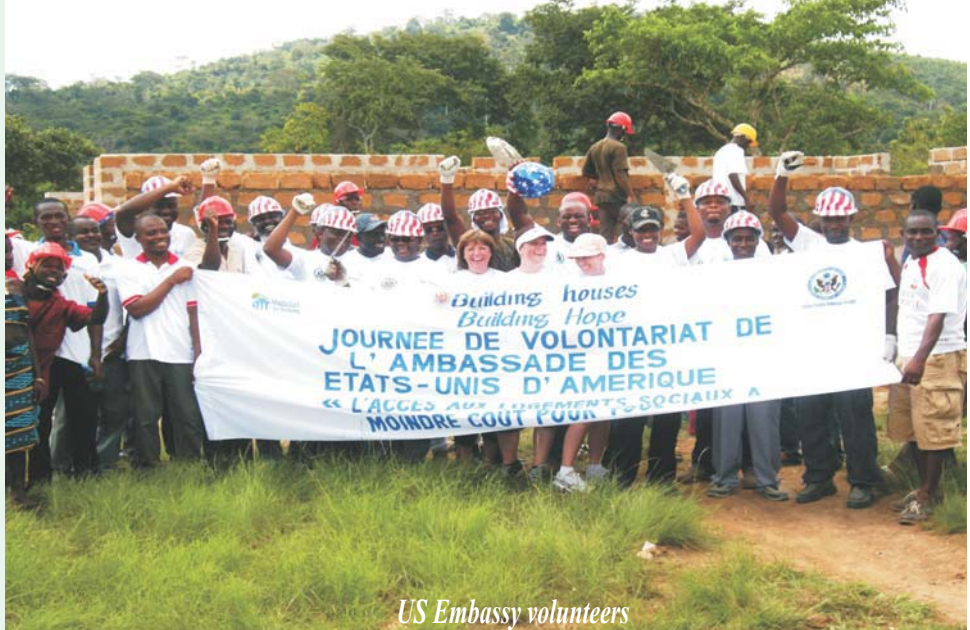
US Embassy volunteers

The U.S. Embassy in Côte d'Ivoire has decided to hold its first Interfaith Day of Service in Kplessou, on October 17, 2009. The day-long activity offered some 15 volunteers from the embassy and three Ivorian religious leaders from different groups the opportunity to help the people of Kplessou to work on the houses sponsored by Northern Ireland HFH. Organized in close collaboration with Habitat for Humanity the Interfaith Day of Service was designed to foster understanding and collaboration among local communities. The day was set aside by the Department of State, following recommendations from the White House,