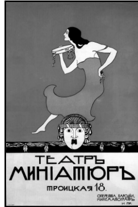
Figure 3. Unknown artist. No date. Poster. Russian Graphic Design . Slide15.