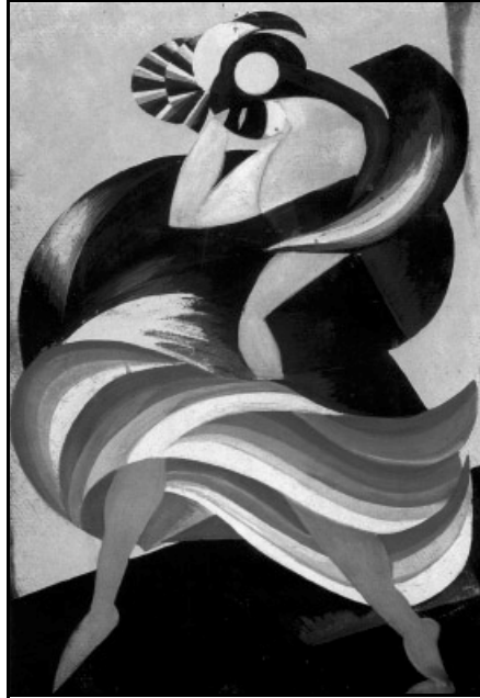
Figure 4. Aleksandra Ekster. Tret'ia zhenskaiia maska . 1921. Aleksandra Ekster 108.

recognize She's unhappiness and the public value of her body art. This fast-moving one-act play belongs to the theatrical category of body art because of its brevity and its use of the body in communicating feminist themes and political argument—precisely what today's viewer expects from contemporary performance art.