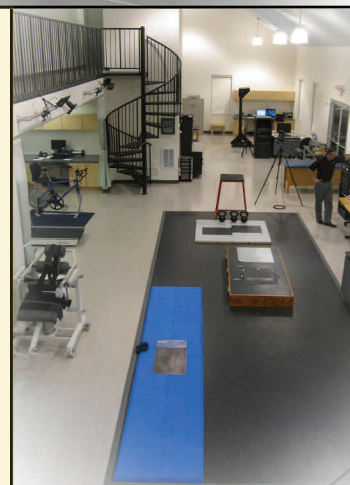
Right: Inside view of new laboratory, equipped with motion analysis, force plates, EMG, physiology, strength, metabolic, and body composition analysis