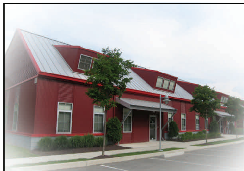
Above: Outside view of new laboratory

The Neuromuscular Research Laboratory (NMRL) is a 5,200 sq/ft applied research facility of the University of Pittsburgh's Department of Sports Medicine and Nutrition within the School of Health and Rehabilitation Sciences. The NMRL collaborates with the Department of Orthopaedic Surgery and the University of Pittsburgh Medical Center. The laboratory houses three separate motion analysis systems for specific task and sport analyses. The laboratory also features defined areas for sports physiology, proprioception, postural stability, and strength assessments. Additional space has been designed for offices for all of the NMRL's faculty as well as a conference and classroom for instruction of the Department of Sports Medicine and Nutrition's sports medicine classes (MS and PhD).