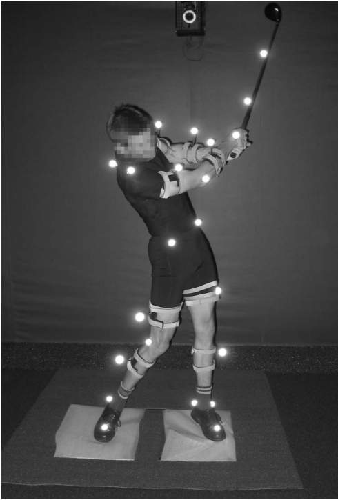
Figure 1. Reflective marker placements.