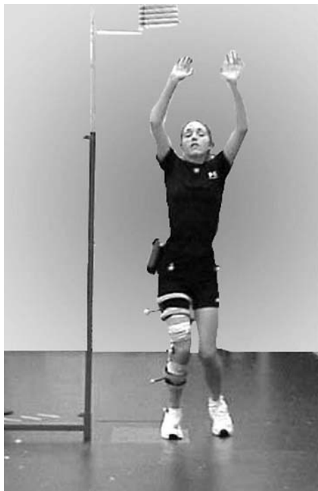
Figure 1 Jump-landing task. (Photograph reproduced with permission.)