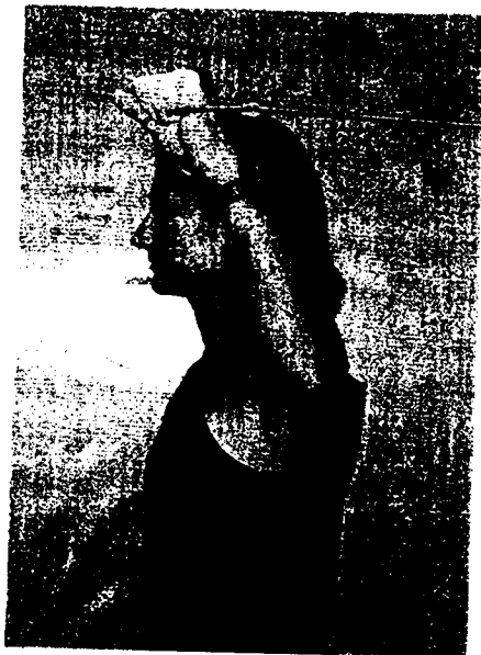
Figure 1 Internal-rotation exercise with elastic tubing.