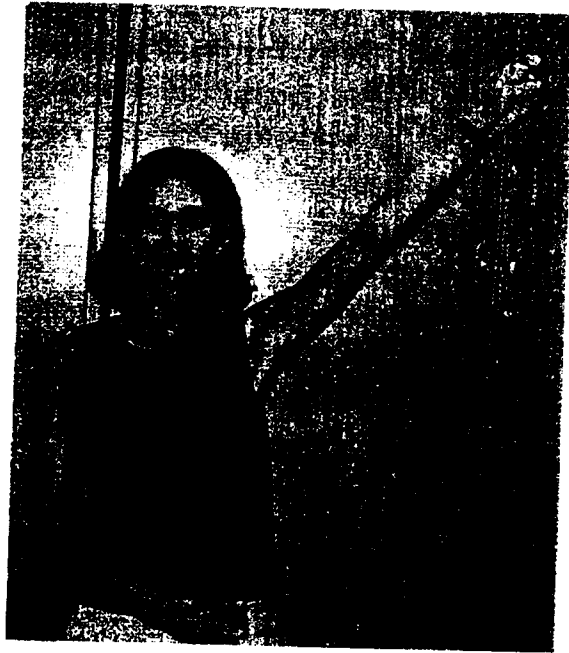
Figure 4 Horizontal adduction/extension exercise with elastic tubing, starting position.