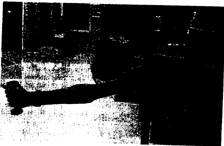
Figure 5 Prone exercise, external rotation with 120° abduction.