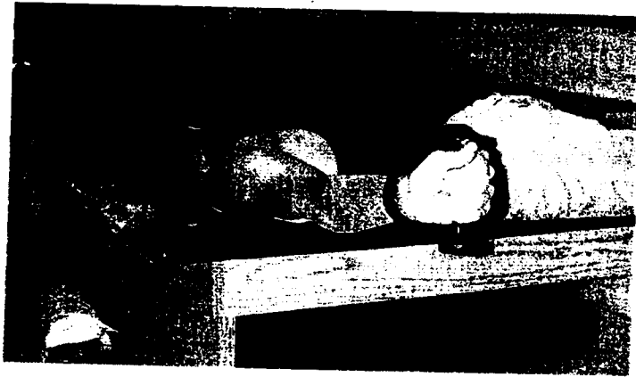
Figure 6 Prone exercise, external rotation with 90° abduction.

The sixth exercise was performed in the same manner but with the subject's shoulder in 90° of abduction (Figure 6).