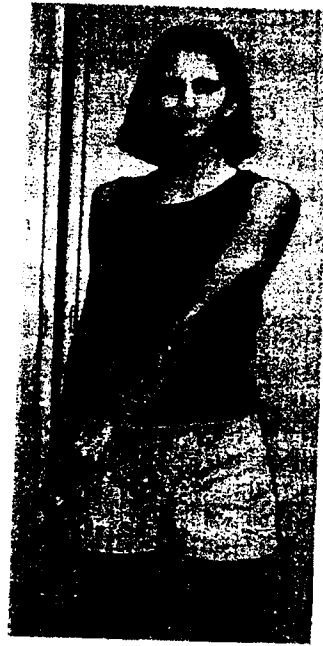
Figure 3 Horizontal abduction/flexion exercise with elastic tubing, starting position.

The fifth and sixth exercises were performed with the subject lying prone on a bench. The shoulder was positioned in 120° of abduction / external rotation for the fifth exercise. The subject was instructed to flex his or her shoulder while maintaining the abducted, externally rotated position (Figure 5).