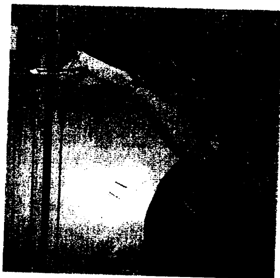
Figure 2 External-rotation exercise with elastic tubing.