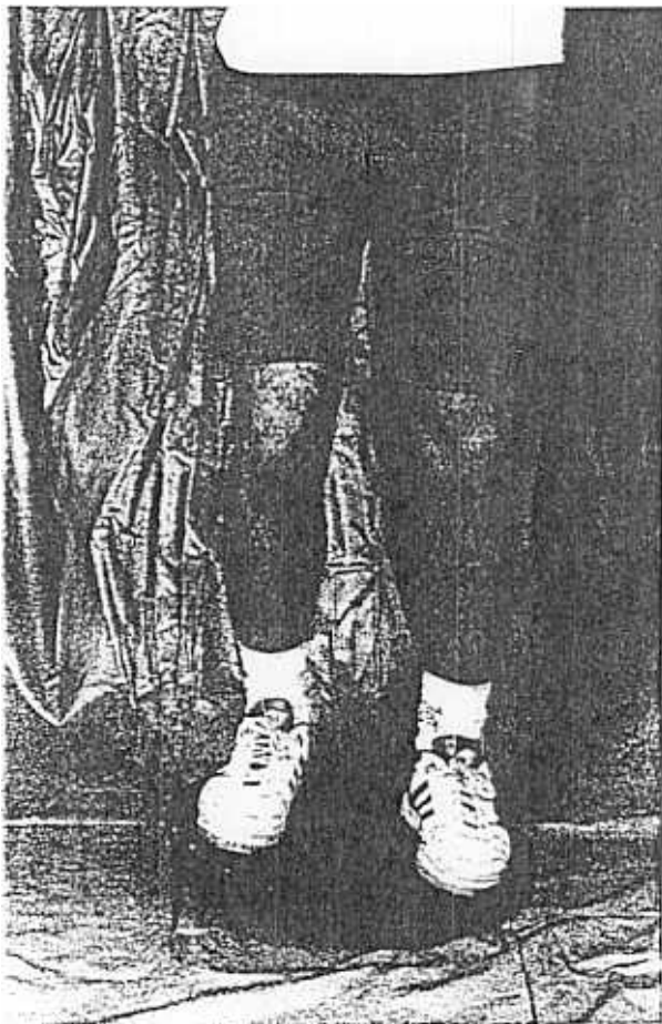
Fig. 4—Lower extremity kinesthetic training on an unstable platform to retrain reflex muscular stabilization.

Rehabilitation considerations may also be related to enhanced proprioception following shoulder capsulolabral reconstruction. Although in our studies the instability group underwent similar rehabilitation activities as the surgery group, mechanical stabilization following surgery could have provided for more effective neuromuscular retaining and hence pro-