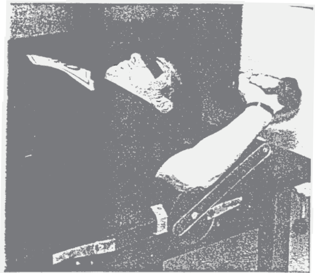
Fig. 5—Joint repositioning exercise at end ranges of motion

moted enhanced function of this mechanism. The rehabilitation program for these patients emphasized proprioceptive input to recognize joint position as well as learning correct movement patterns and techniques apart from development of strength and endurance. These exercises included matching and rematching joint position, weight bearing through the upper extremity, and open kinetic chain exercises. The later stages of the rehabilitation focused on activities that promoted proprioceptively mediated reflex joint stabilization. Although this reflex arc has not been demonstrated in the shoulder, similar neuromuscular mechanisms in the knee have been identified reproducibly and believed to play a key role in joint arthrokinematics.