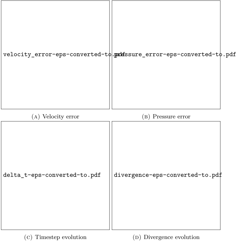
FIGURE 4. Accuracy and adaptability results.