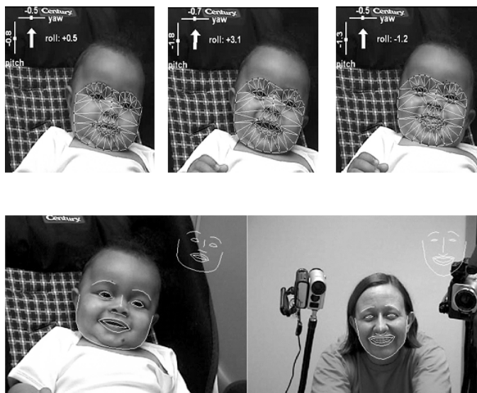
FIGURE 1 Active appearance models (AAMs). (a) The AAM is a mesh that tracks and separately models rigid head motion (e.g., yaw, pitch, and roll, visible in the upper left portion of the images) and nonrigid facial movement over time (left to right). (b) In this output display, each partner's face is outlined to illustrate lip corner movement, mouth opening, the eyes, brows, and the edges of the lower face; these outlines are reproduced in iconic form to the right of each partner.

The temporal precision of automated measurements is ideal for examining infant–parent interaction at various time scales. Researchers are often interested in