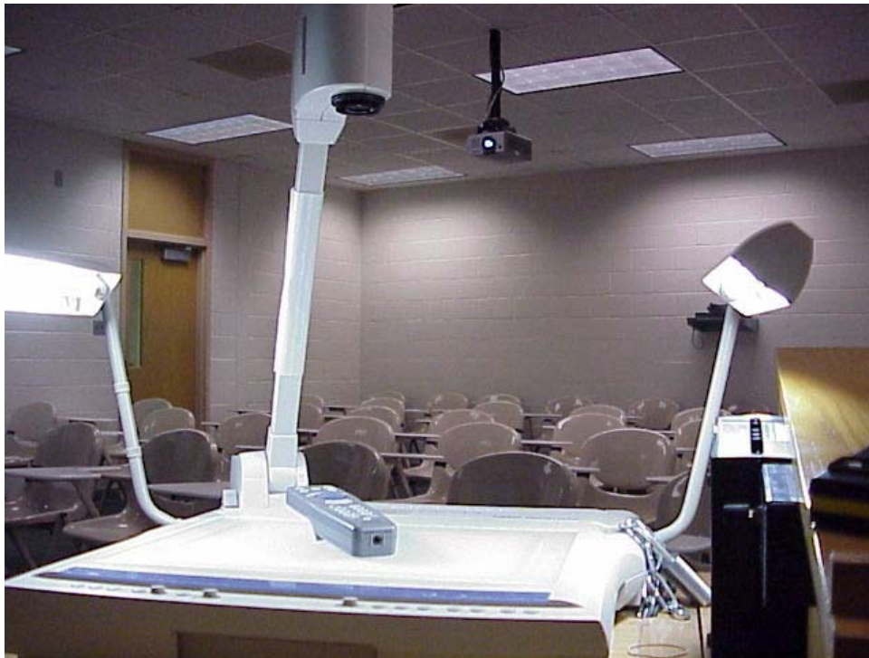
Fig. 10.8 Sony's DC-13 document camera connected to the ceiling-mounted projector

Visual Presenters/Document Cameras Devices such as that illustrated in Fig. 10.8 are excellent, in combination with a projector, for the display of a wide range of three dimensional objects, as well as transparencies and paper-based text or graphics. Everything from a Palm pilot training session to a lesson based upon maps or artwork can be enriched by projection, rather than hampered by the need to pass the visual display around the room.