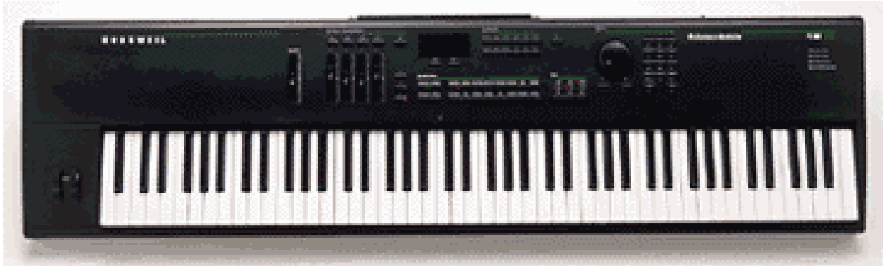
Fig. 10.4 Kurzweil PC 88mx keyboard

In a sense, electronic music keyboards are to music composition and production what a word processor is to writing. A word processor enables one to form words on the page by pressing the appropriate keys on the keyboard. Electronic music keyboards enable the beginner to generate harmonic sound by pressing keys on the keyboard. As a result, learners can more quickly produce presentable, even entertaining, music. This immediacy of pleasing response can have a powerful motivational effect, encouraging the learner to repeat the experience and progress to the next level of skill. As we noted already, this does not obviate the need for a good teacher. Quite the contrary, a good teacher will capitalize on the advantages to be gained from the electronic keyboard to introduce a wider audience of children to musical skills.