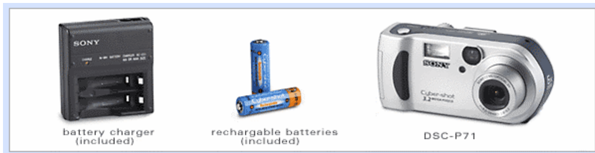
Fig. 10.3 The Sony Mavica DSC-P71 digital camera

The digital image is captured on internal memory, memory card or memory stick instead of on a roll of film. This picture can then be downloaded immediately (via USB or firewire) for viewing or for incorporation into word-processed documents, slide shows, posters, or presentations in general. The pictures stored on the camera can be erased and replaced with other shots without the delay and expense of film processing and developing, generally with "on board" camera tools.