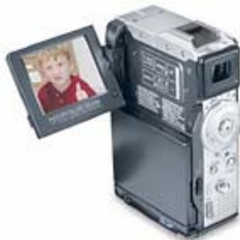
Fig. 10.2 The JVC-GR-DVP3 mini-digital video camcorder

Digital video and still image cameras Video cameras, or camcorders, are useful for recording events of interest in any subject area. A digital video camera bypasses this conversion process, recording digital data (audio and video) directly onto its own internal memory or onto a removal memory medium. Fig. 10.2 illustrates the JVC mini-digital video camcorder.