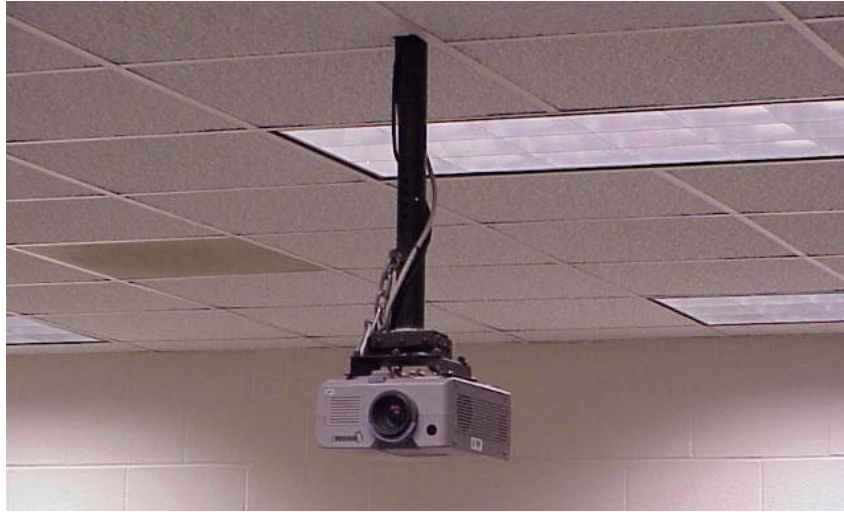
Fig. 10.6 Ceiling-mounted projector

In a truly "smart" classroom, all devices that can be projected (slide projectors, DVD/CD-ROM, laserdisc, computer, document camera, TV, videocams) are controlled from a central podium, which functions much like a kiosk to give the instructor control over the media he or she elects to display.