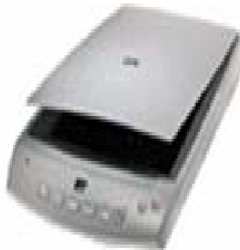
Fig. 10.1 Hewlett Packard flatbed scanner

Scanners Scanners are used to digitize flat (usually paper based) images or text so that they can be stored and manipulated by a computer. Flatbed scanners are most commonly found in classrooms (Fig. 10.1 illustrates a flat-bed scanner.) Fixed "pass-by" scanners and handheld scanners are often used in the library and for security control tasks within a school.