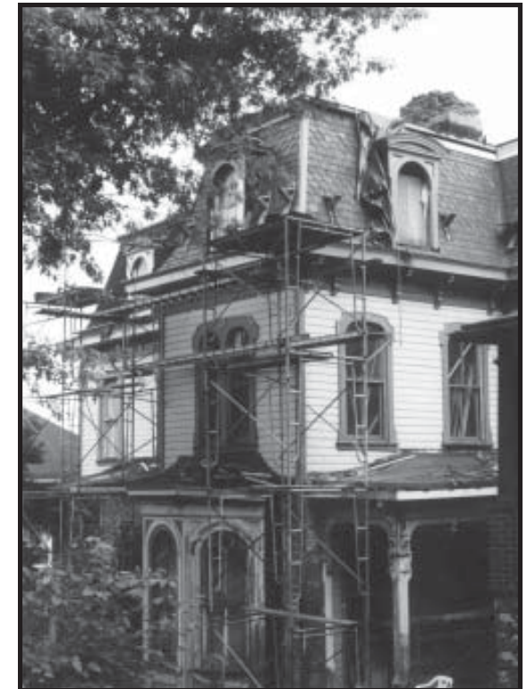
119 E. Elizabeth St. ~ view b