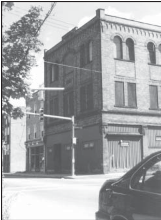
2001 G. C. Murphy's Building at 2nd Ave. and Flowers

Here are four more views of the G.C. Murphy's building. The two photos on the right-hand side of the page show the entrance to the Independent Order of the Odd Fellows (IOOF) Lodge. It was a fraternal organization similar to the Mason's society. Many such groups were brought to the U.S. from Europe in the late 19th century, fulfilling the social needs of immigrant workers.