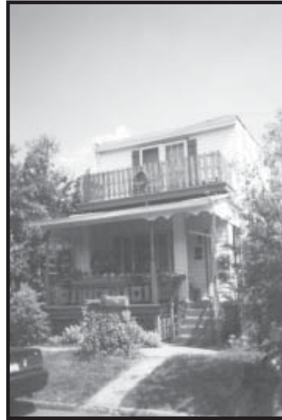
c Langhorn St.

All of these shots are from August and September 2001. Photo "a" reveals a turn of the century home that is in need of some exterior repairs; it shows that the building has been weathered with time. With a little work, though, improvements can be made. Look at photos "d" and "e", for example, where a beautiful late 19th c. house with a mansard roof is being restored. Along with the charming house in photo "c", both homes prove that change can happen for the better. e