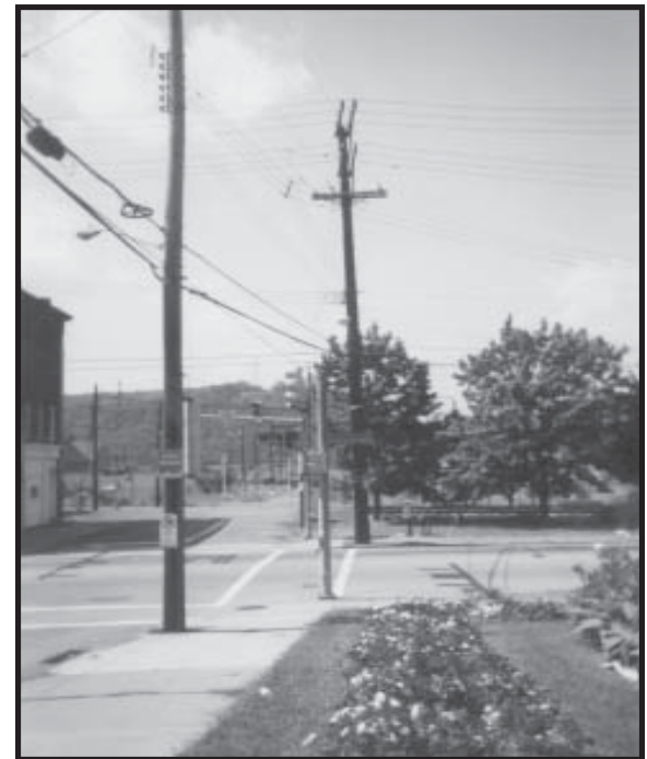
e 2001 Hazelwood Ave. at 2nd Ave looking beyond where #91 would have been