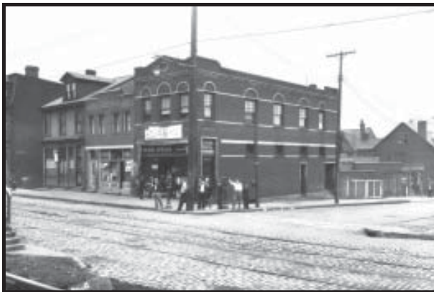
a soda fountain/ pharmacy