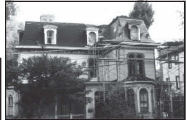
119 E. Elizabeth St. ~ view a