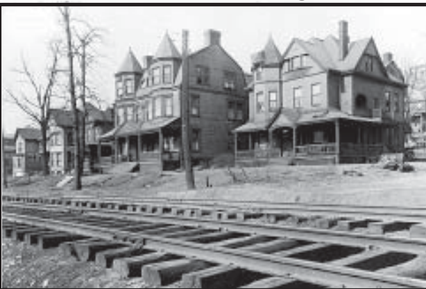
19th century mansions once owned by the first grouping of Hazelwood residents, that of the wealthy who sought escape from the city