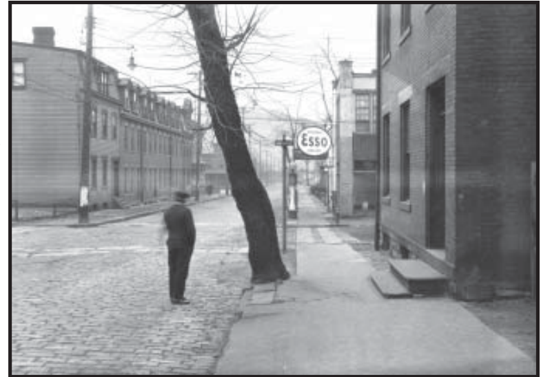
Modest worker row houses and an old Esso gas station