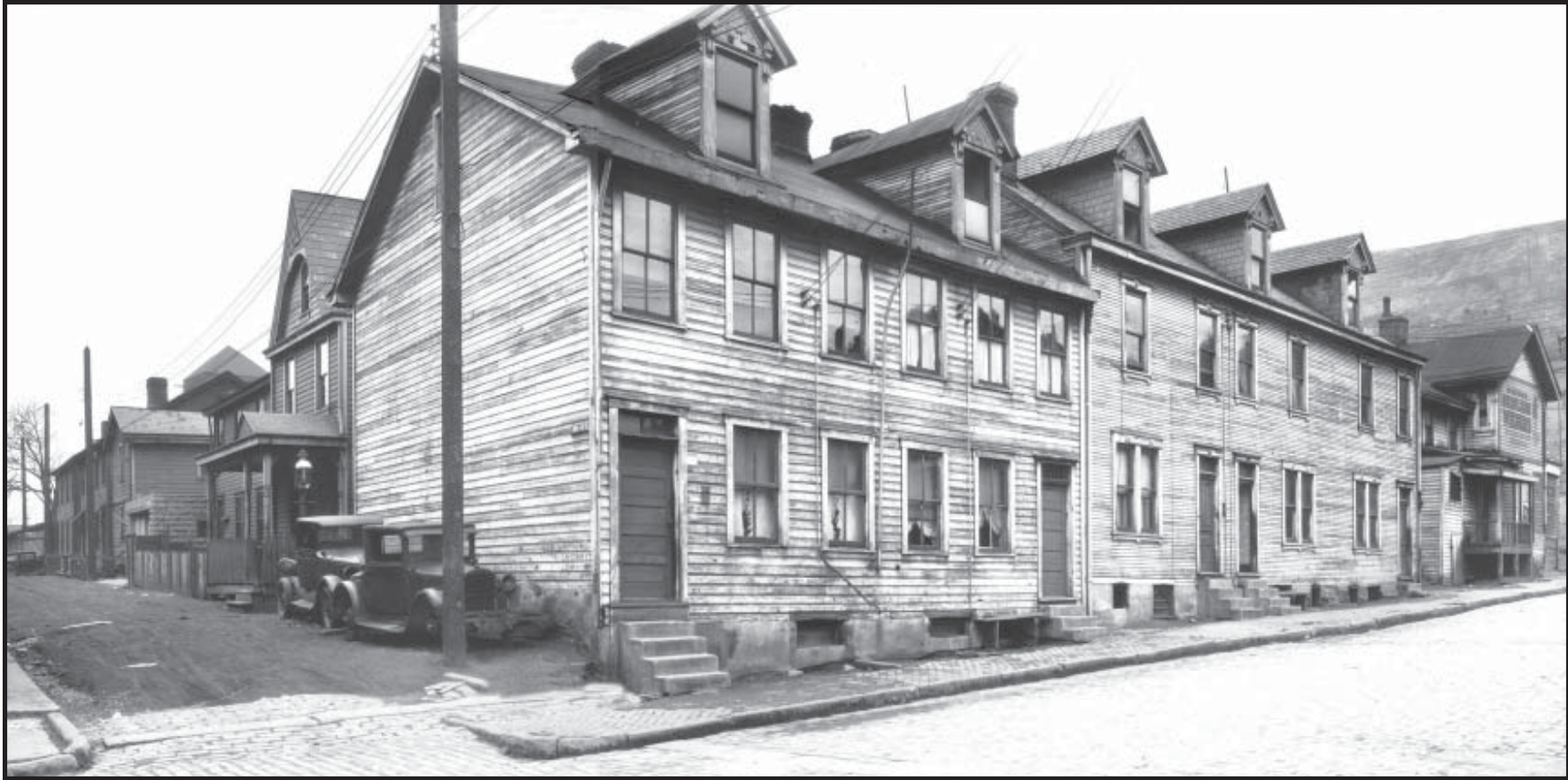
a Rutherglen at 2nd Ave 1933

Unfortunately many buildings in Hazelwood were eliminated with the expansion of the steel mills, namely J&L, and later LTV. This woodframe rowhouse is an example of typical worker housing during the early 20th century.