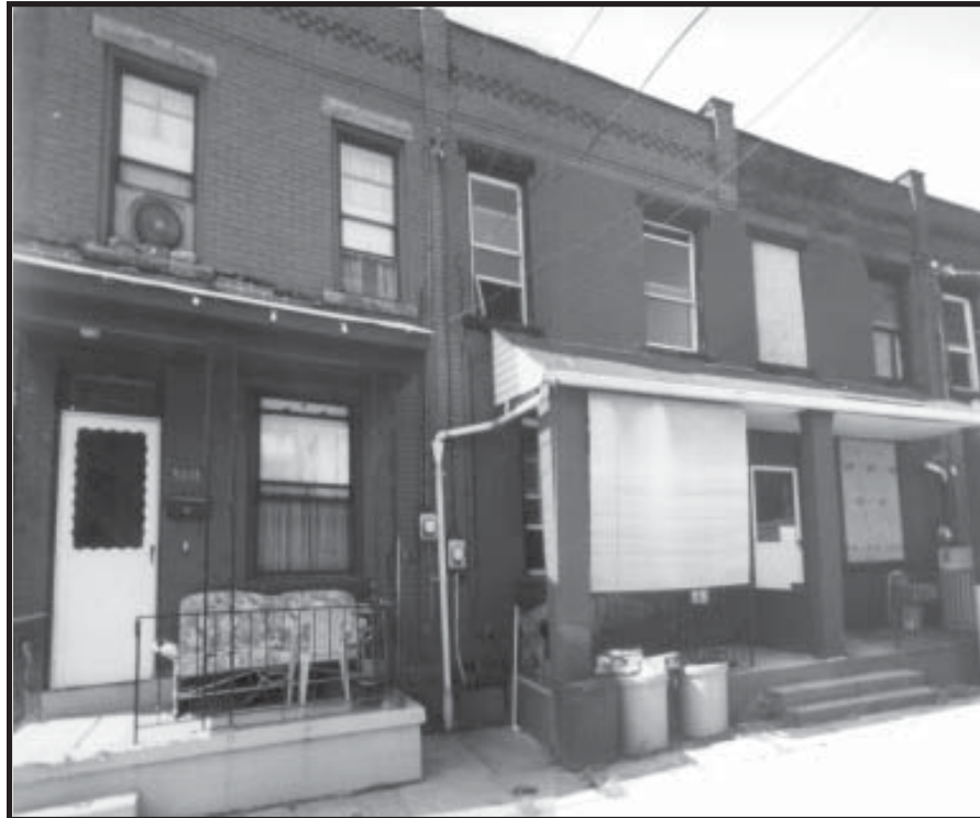
a Chaplin Street