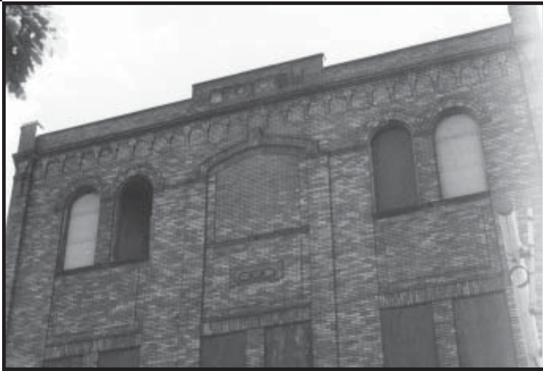
a 2001 IOOF detail on the 2nd Ave. facade