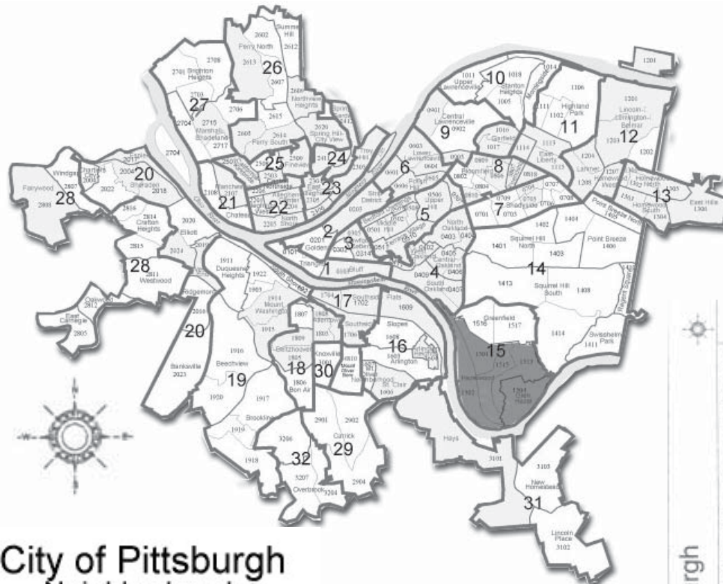
Hazelwood With Respect to Surrounding Neighborhoods

City of Pittsburgh Neighborhoods 1990 Census Tracts □ CD Eligible ■ Wards ■ Hazelwood+Glenhazel