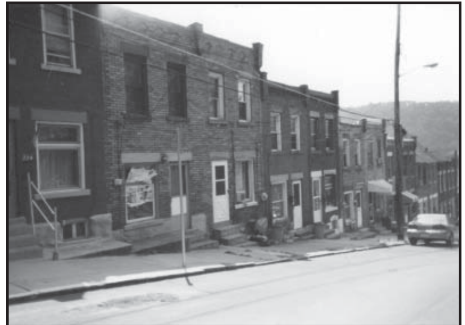
c Glenwood Avenue

Several of the rowhouses in Hazelwood are in need of repairs. Both photos "a" and "c" reveal boarded up windows and an atmosphere of neglect. The rowhouses in photo "b", however, are in much better condition than the previous two. The "b" inhabitants were permanent, long-time residents as opposed to the transient residents of the housing in "a" and "c", leading to the abandoned feel captured in the pictures.