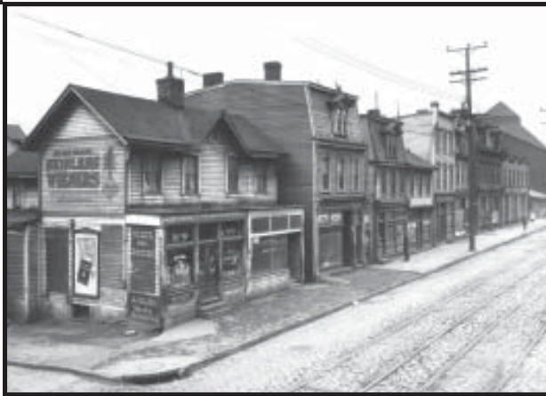
a closed down grocery