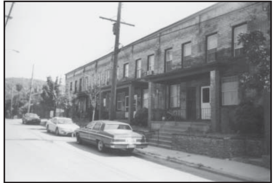
b Tecumseh Street