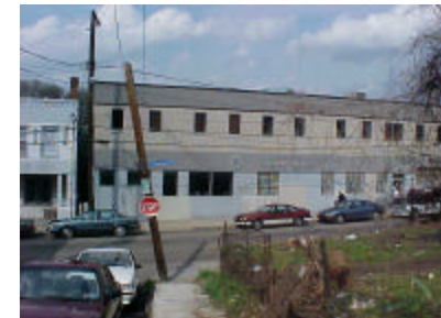
Leaning utility pole and vacant lot littered with refuse