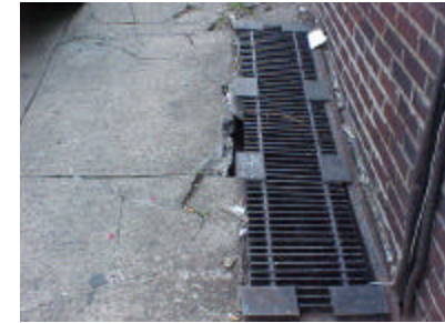
Deteriorating sections of sidewalks