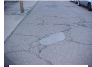
Cracked roadway and potholes