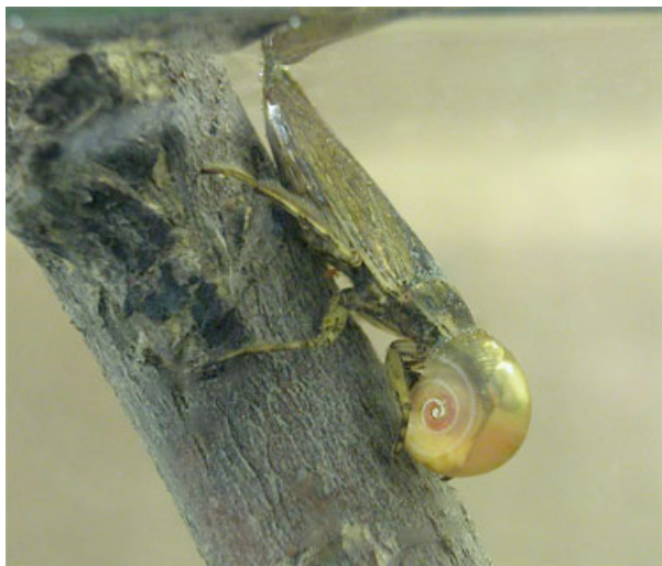
Fig. 1. Image of the giant water bug ( Belostoma flumineum ) feeding on the freshwater snail Planorbella (Helisoma) trivolvis . Water bugs are shell invaders that use a modified sucking mouthpart to pierce the body of the snail and inject digestive enzymes while holding the snail with the forelimbs.

2007b, 2008). Studies have shown that snails can reach a size refuge from these two predators near adulthood (Alexander & Covich 1991; Hoverman unpublished data) but the size refuge requires 1–3 months to reach. While we have a firm understanding of the phenotypic responses of P. trivolvis to water bugs and crayfish, we have not explored the effectiveness of the responses against each respective predator. We also do not know whether the responses result in survival trade-offs, or how developmental plasticity affects the outcome of predation, which is necessary for understanding predator-prey dynamics in the system.