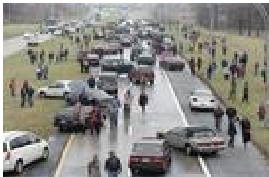
(WITH A BANG?)